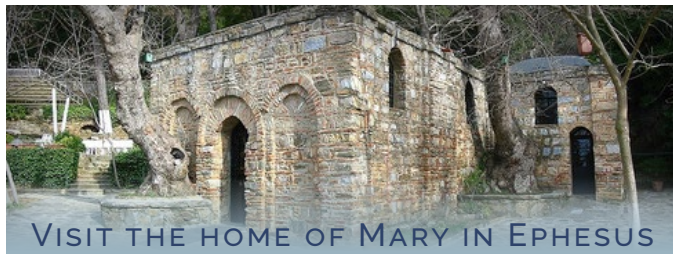
VISIT THE HOME OF MARY IN EPHEBUS

Journey in footsteps of St. Paul and the apostles through the cities of Thessaloniki, Philippi, Athens, Ancient Corinth, Ephesus, Patmos, and More