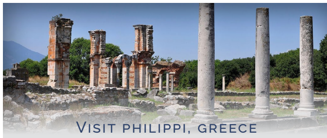
VISIT PHILIPPI, GREECE