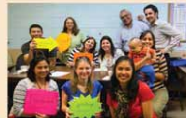
Join us! / ¡Intégrate al Grupo Hispano!