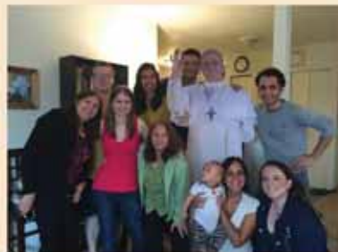
Party to celebrate the anniversary of Pope Francis / Celebración de la elección del Papa Francisco.