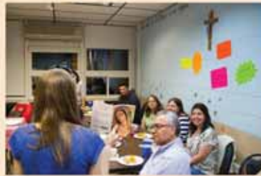
Improve your English and Strengthen your Faith Class / Clase de Inglés y Fe