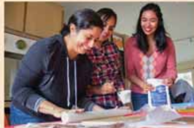
Cooking for rotating shelter / Preparación de comida para el albergue ambulante