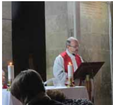
Father Celebrating Mass in Nazareth