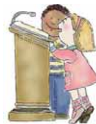
Children's Liturgy of the Word

In the Children's Liturgy of the Word , children hear the scripture readings proclaimed and explained to them at an age appropriate level. During the 8:30 a.m. & 10:30 a.m. Masses, at the time the scriptures are to be read, the priest invites the children in grades K-3 to come to the front of church for the Children's Liturgy of the Word. Adult volunteers then lead the children to the Chapel, located in the basement of the church, where the children hear and participate in the Word of God at their own level. At the time of the collection, the children are led back upstairs and return to their parents for the Eucharistic prayers.