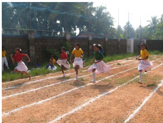
The finished playground includes a running track, basketball court and open play spaces.