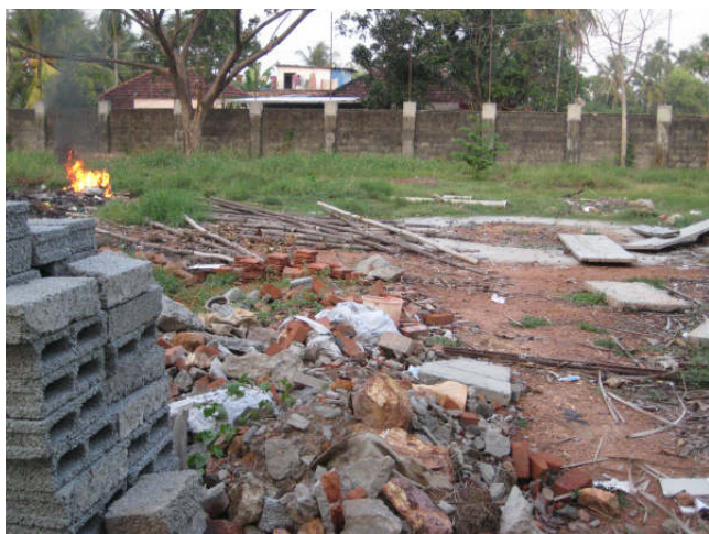
The future site of the playground for the Home of Hope Orphanage in India.